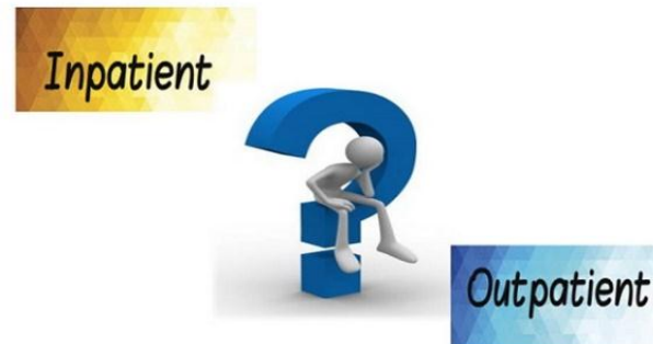
Inpatient Vs Outpatient Coding

Answer (continued): For those seeking to identify Massachusetts inpatient acute care hospitals the APCD, the highest version of following fields can be used: