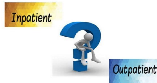
Inpatient Vs Outpatient Coding

Answer (continued): Different coding nomenclatures are used for inpatient and outpatient procedures but the same nomenclature is used for diagnosis codes.