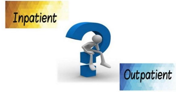
Inpatient Vs Outpatient Coding

Answer (continued): Those experienced in analyzing Inpatient Case Mix data should keep in mind that a single patient-level episode of care in Case Mix can generate many versions of claim lines in APCD. Also, as of 12/2013, close to 90% of medical claims were for care performed in the outpatient setting (see Figure 2), therefore Type of Bill on Facility (MC036) ensures filtering for hospital inpatient acute care are necessary.